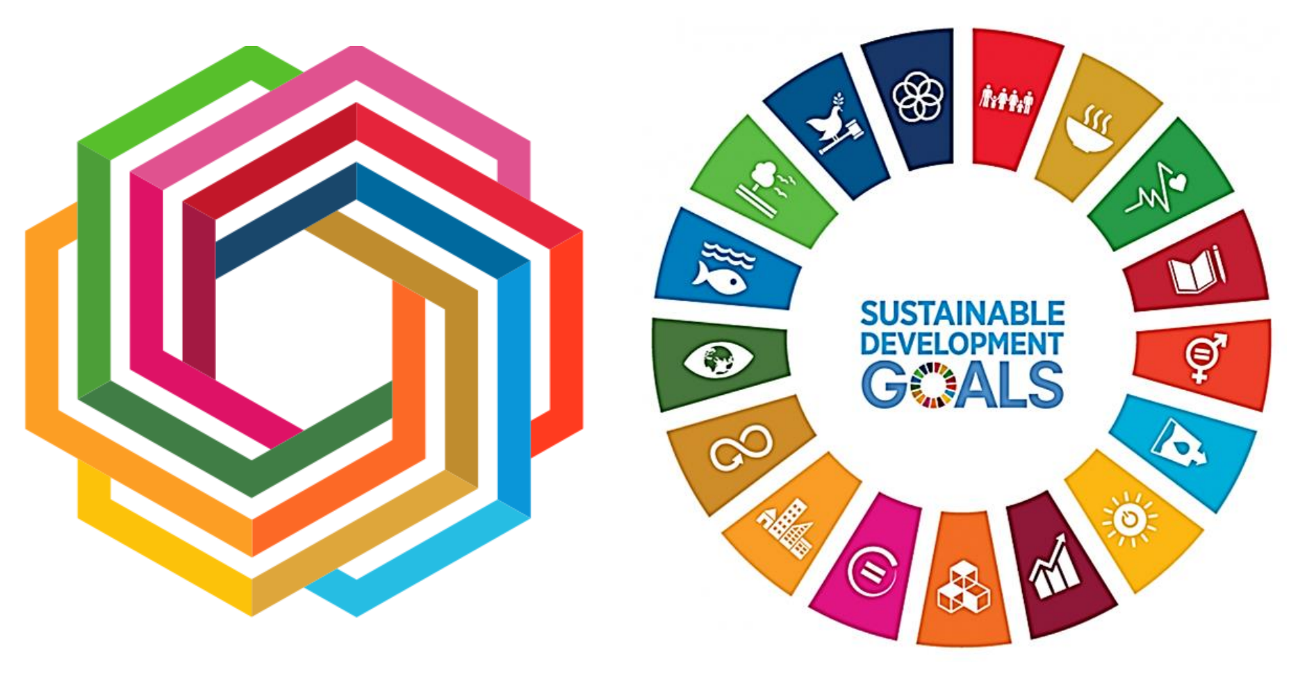
South Valley University (SVU) Sustainability Bulletin 2020/2021