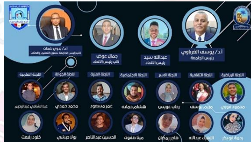
SVU student's union