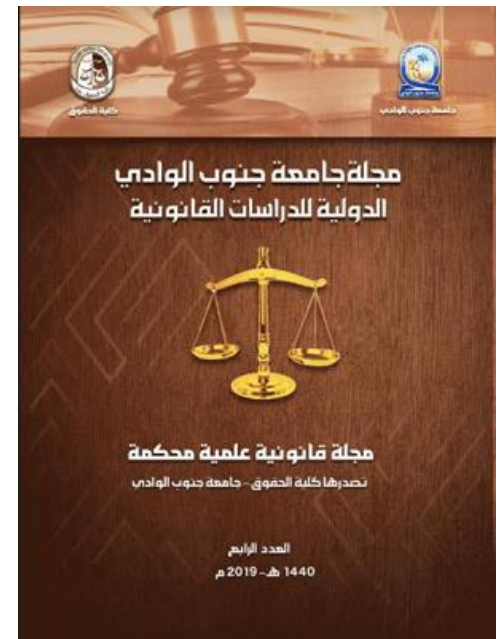
SVU journal for law studies